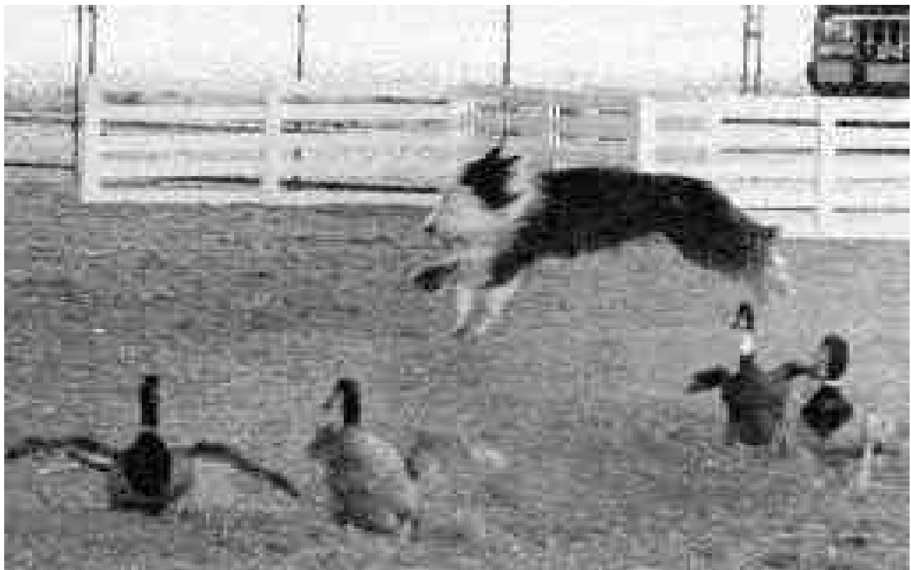
A Bearded Collie playing with a flock of ducks.

Earthdogs are hunting dogs bred to pursue quarry into burrows or otherwise underground. The diminutive Scottish terriers are quite specialized for this task. Their piercing bark and ferocity is used to drive the prey out of their lairs for the hunters. You can travel to the Hebrides today and find Cairn Terriers gleefully pursuing farm rodents as they have for centuries.