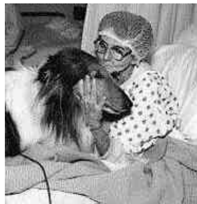
A Rough Collie consoling a patient.

Since many of the Scottish breeds are known for their friendly, accepting dispositions, they make some of the best Therapy Dogs.