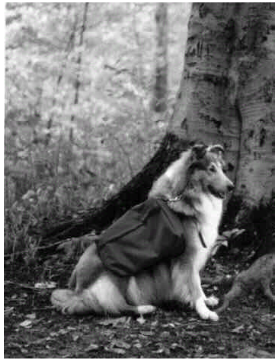
"Bonnie" (Bar-Jac Touch of Class, BPD, CGC), wears a standard cargo pouch for backpacking or messenger duty.

Search and Rescue (SAR) dogs are trained to search for victims in