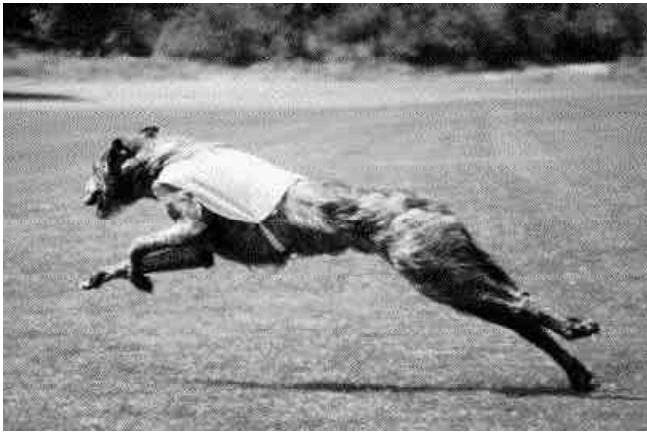
"McEwan," a Scottish Deerhound, coursing.

sions), Directed Retrieve, Signal Exercise, Directed Jumping, and Group Examination trials.