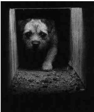
Terrier hunting in an Earthdog trial.

usually mean herding sheep, you might see a variety of live-stock . For example cattle and sometimes even ducks are used.