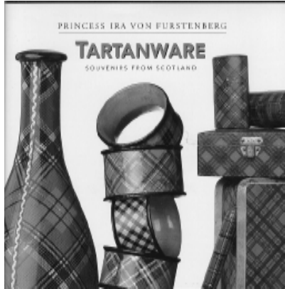
Tartanware Souvenirs from Scotland By Princess Ira Von Furstenberg $19.95/Pavilion/1997

Written by the granddaughter of the Duke and Duchess of Hamilton, this book is a coffee-table tour through Scottish kitsch. It is a small volume (72 pages, approximately 7" square), but it is full of color illustrations of the many types of crafts which have been embellished with tartan. Tartanware is anything covered in a rich tartan pattern, from sewing tools to shoelaces.